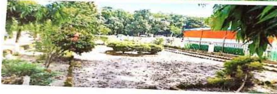
Principal Falakata College Falakata, Alipurduar